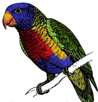
Rainbow Lorikeets We're by the lions

People sometimes miss all the interesting birds around the zoo. Follow the hints and see if you can find these animals.