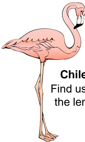
Chilean Flamingo Find us on the 'bridge' by the lemurs and geladas