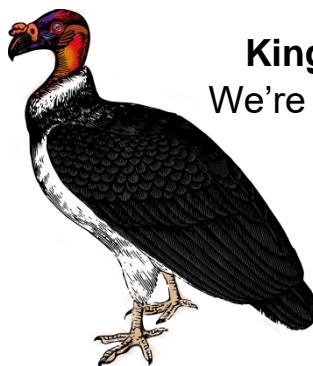
King Vulture We're by the wolves