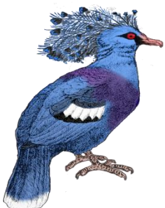
Victoria Crowned Pigeon