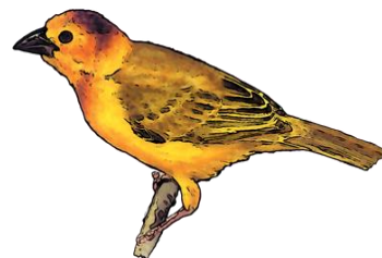
Weaver Bird We're inside the giraffe building