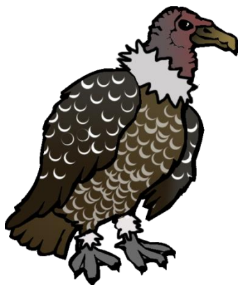
Rüppell's Griffon Vulture We in vulture valley, through the giraffe building