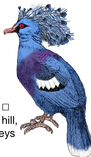
Victoria Crown Pigeon At the bottom of the steep hill, opposite the spider monkeys

After finding these birds, write down one cool fact about each of them on the next page. Find information about them on signs near their enclosure, or just by watching what they do and how they act. Record information like: how big they are, what food they like to eat, or anything else you want to remember.